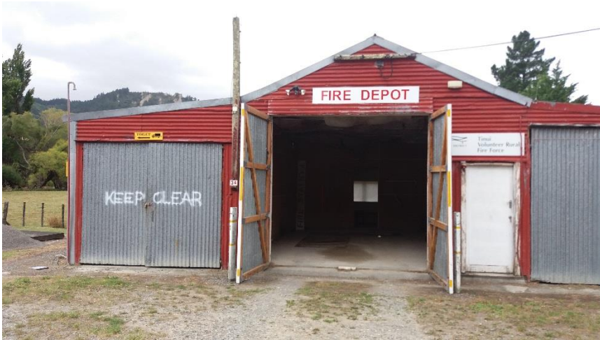
Figure 1 Current Tinui depot