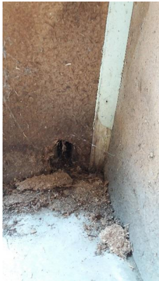
Figure 2 Vermin damage