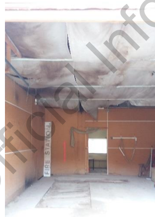
Depot interior with saggy roof lining