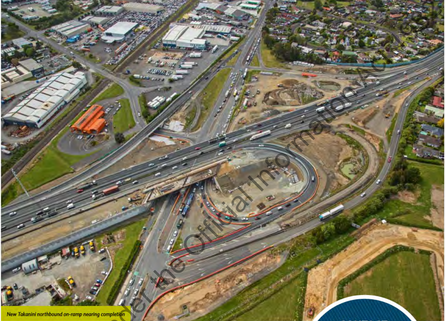
New Takanini northbound on-ramp nearing completion

The new and improved Takanini Interchange will reduce known safety risks, improve traffic flow and provide a more reliable trip for commuters.