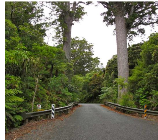
Figure 43: SH12 Darby and Joan Bridge

The Darby and Joan bridge, shown in Figure 43 is located between two protected kauri trees. Widening the bridge is not feasible without damaging the trees or creating a new alignment that bypasses the trees.