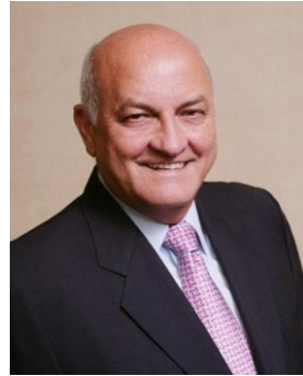
Sir Owen Glenn KNZM, ONZM