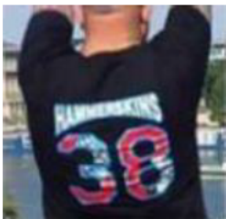
Southern Cross Hammerskins