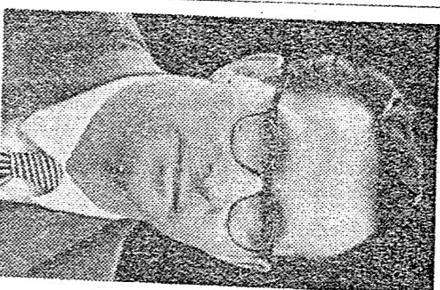
MR F. W. HARVEY