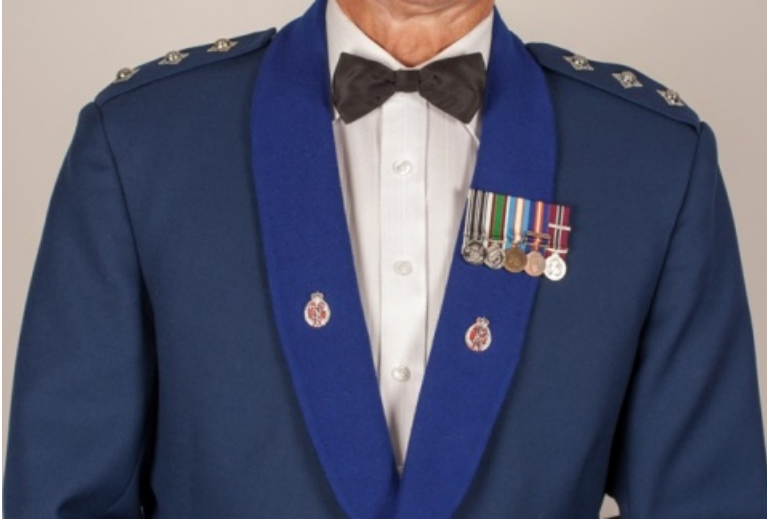
Mess dress for senior sergeants and below with miniature medals