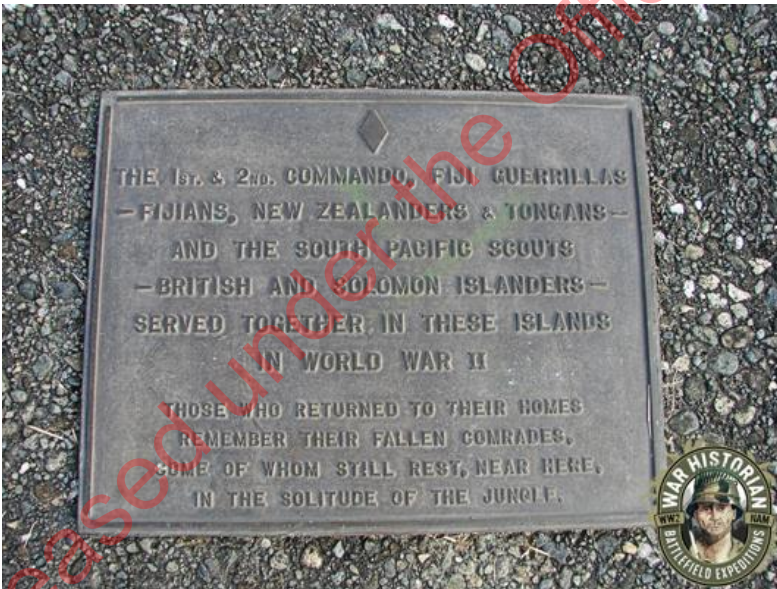
Figure 2: A memorial to the Pacific Commandos is located at Henderson Airfield.