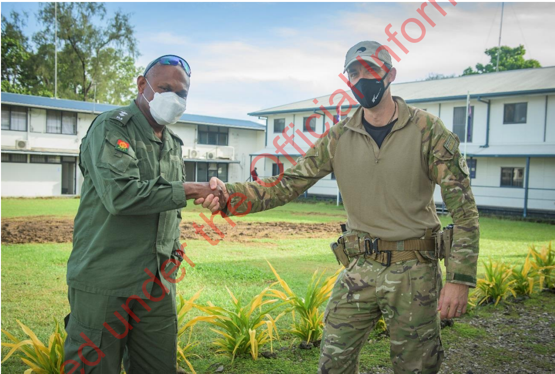
New Zealand and Fiji Commanders during Operation Solomon Islands Assist