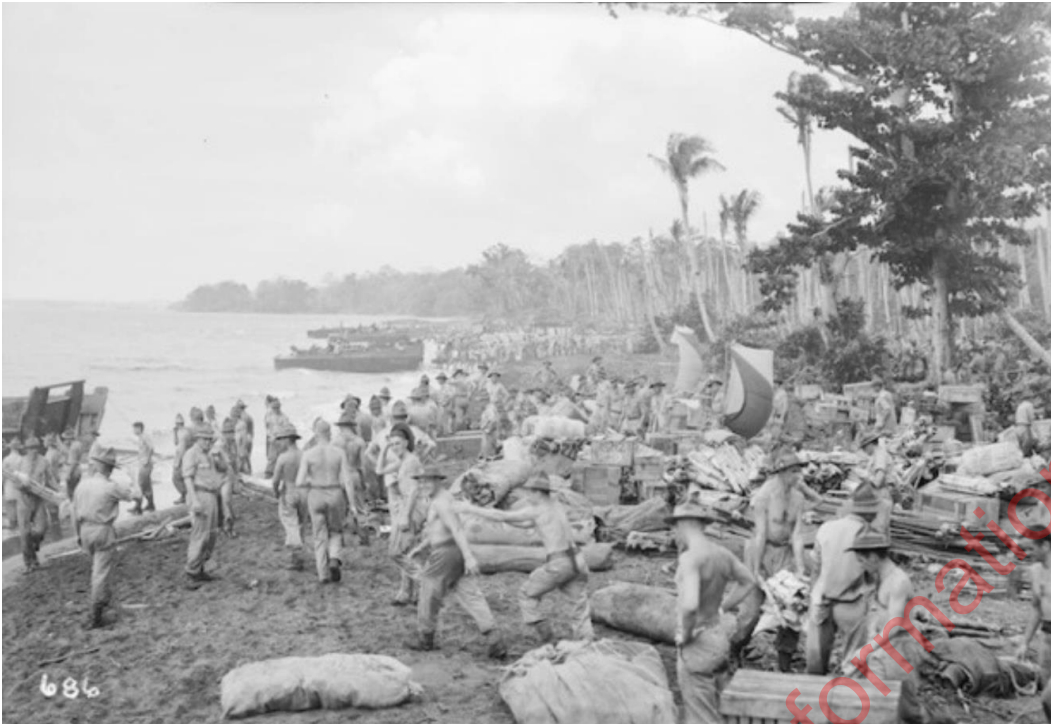
Figure 1: From August 1942, the Americans landed at Guadalcanal in the Solomon Islands in the attempt to push back the Japanese. A year later members of the New Zealand 3rd Division began to assist them. Here New Zealand troops from that division sort out equipment on the beach at Guadalcanal.