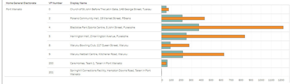
Ordinary Votes on a Voting Place Level