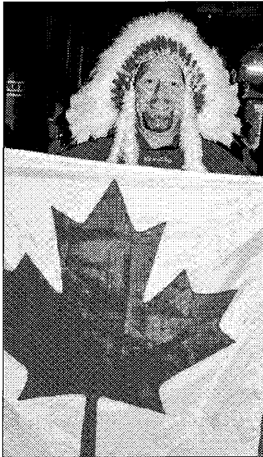
Big chief: A Canadian fan before kick-off in the 2011 Rugby World Cup pool match between France and Canada at McLean Park in Napier on Sunday night.