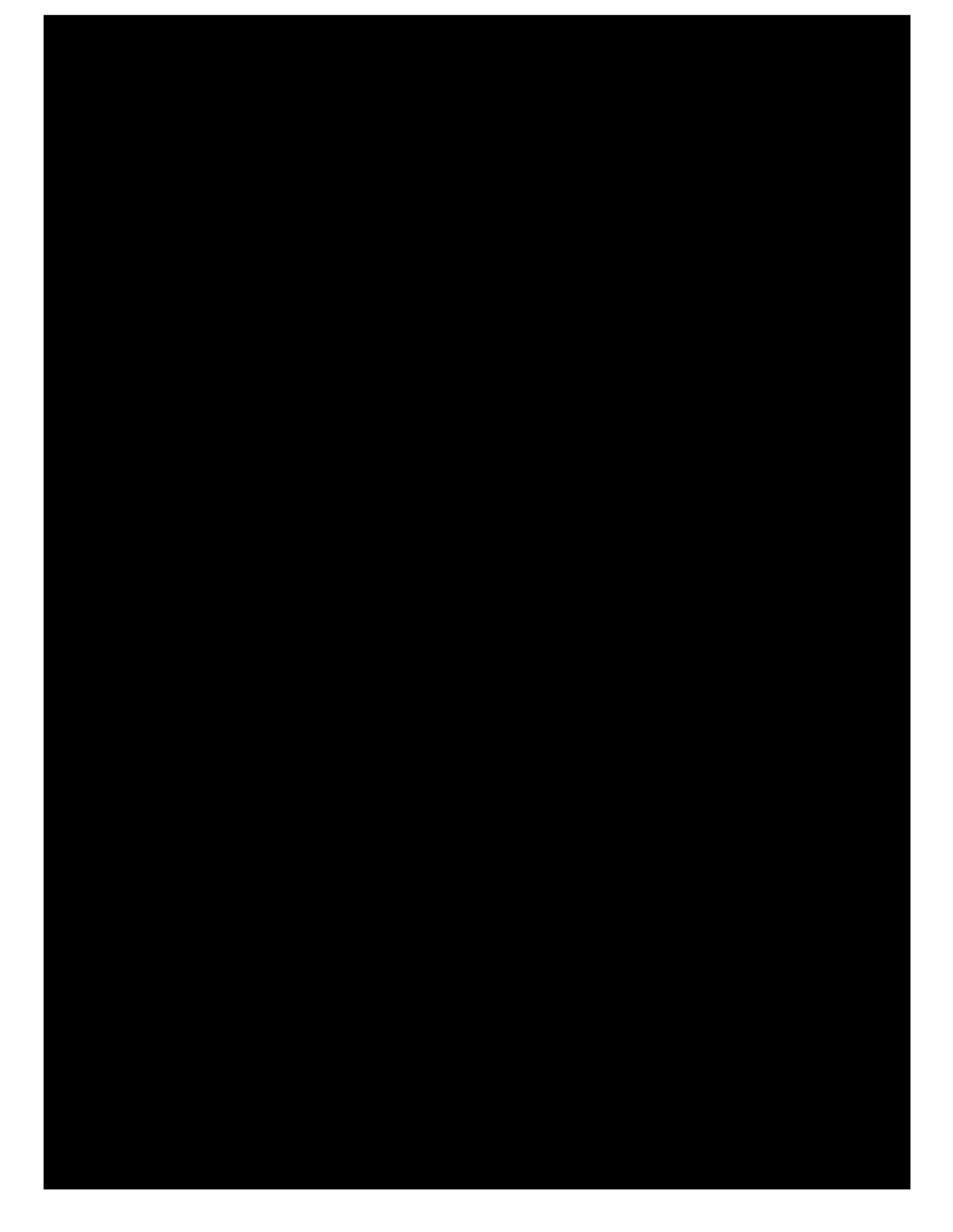
Withheld as legally priveleged