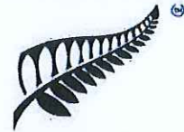
NZ Way Fern (NZ Story)