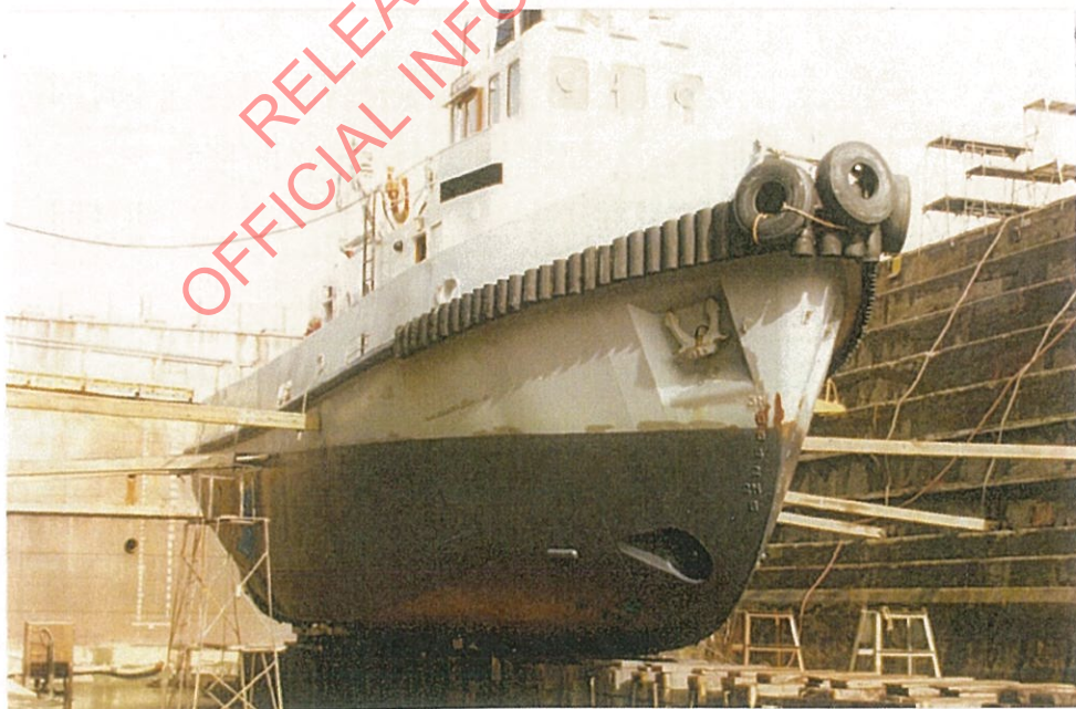
R.N.Z.F.A. "ARATAKI" Calliopi Graving Dock - August 1992