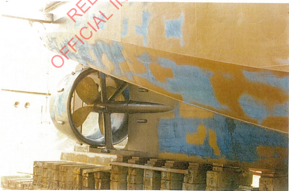
R.N.Z.F.A. "ARATAKI" Calliopi Graving Dock - August 1992