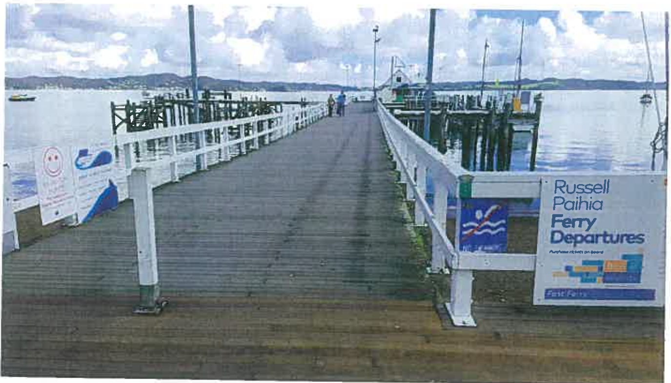
View of Approach Bridge at Russell Wharf