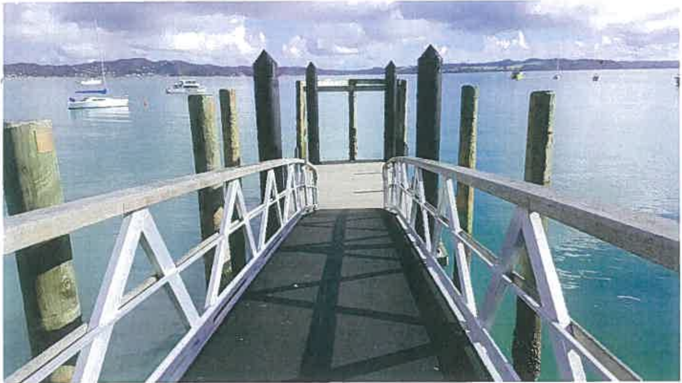
View of recently renewed cruiseship pontoon (concrete pontoon and aluminium gangway) in 2012