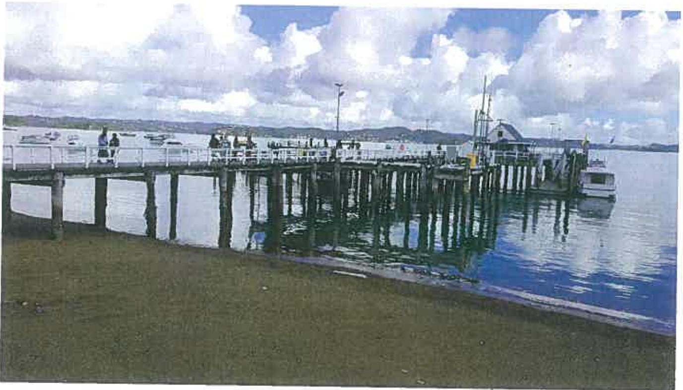
Overall view of Russell Wharf