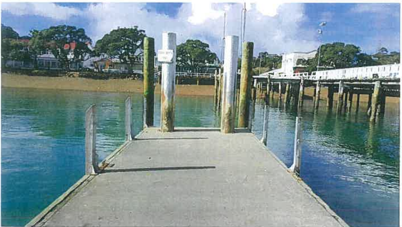
Existing concrete floating pontoon & aluminium gangway (Vertical stanchions upgrade and working well)