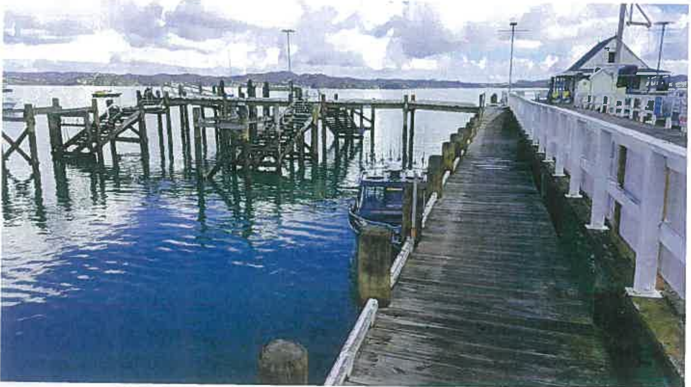
View of remaining landing steps at southern access way