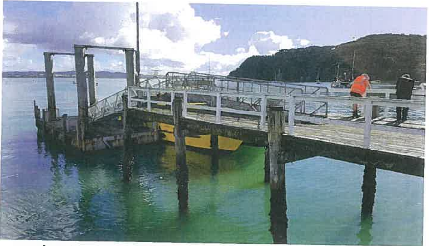
Overall view of Aluminium gangway and old steel pontoon that requires renewal soon