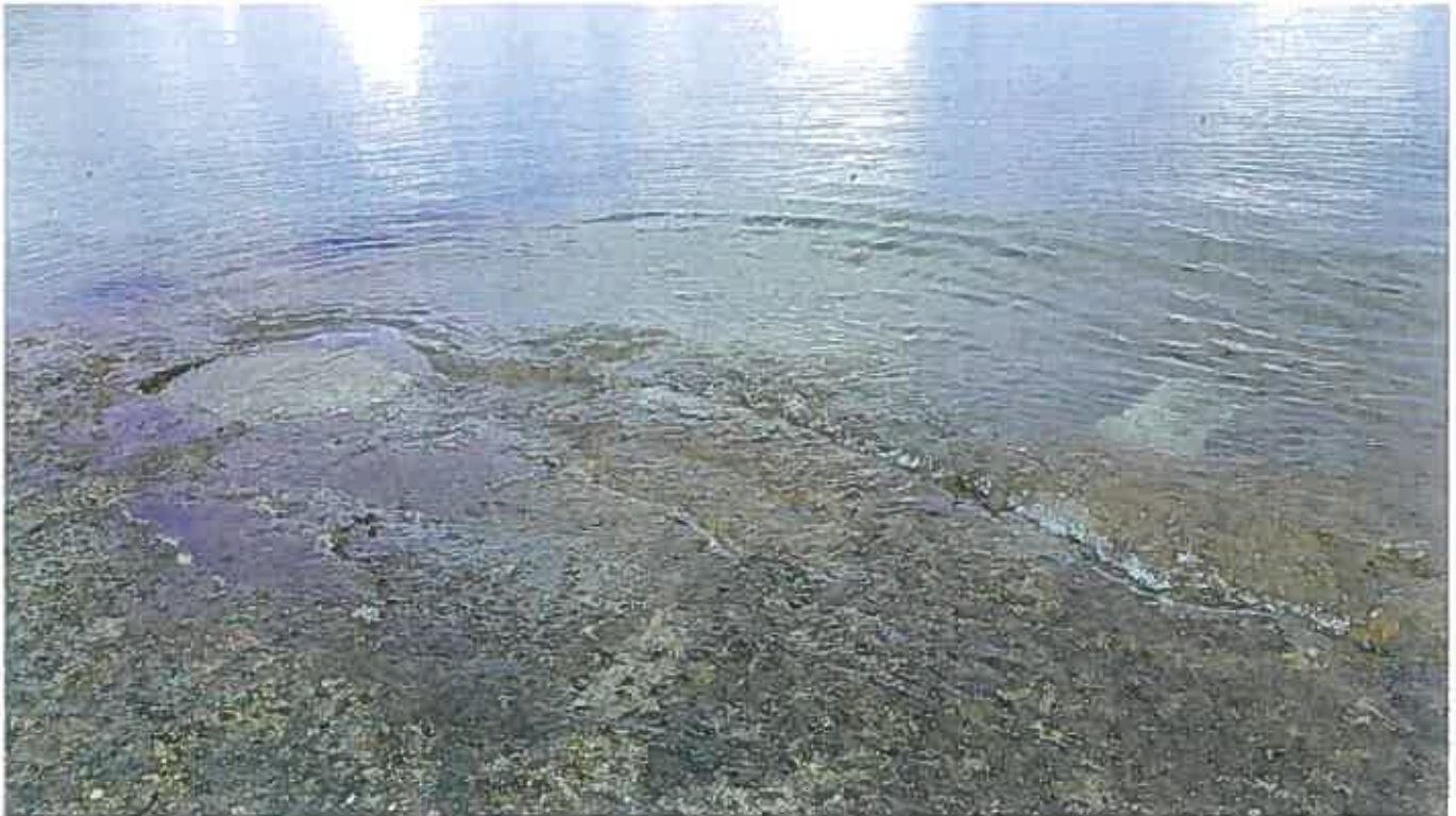
Recent damage on recently concreted boat ramp exposing old concrete ramp