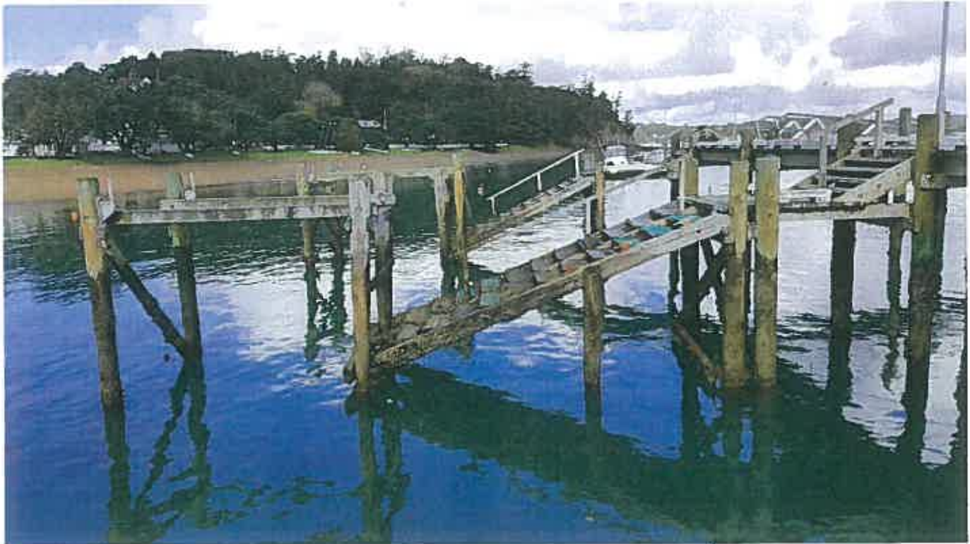
View of remaining landing steps at southern access way – Recommended to replace with floating pontoons at in future