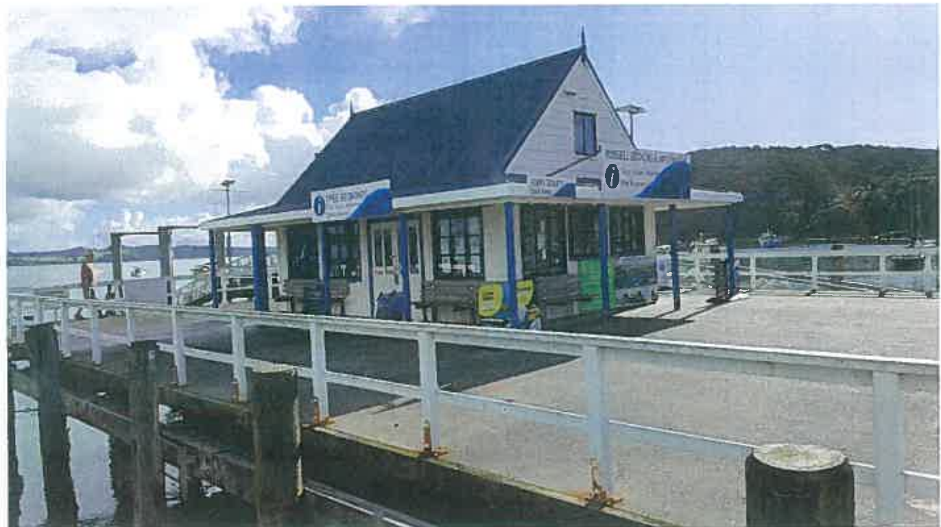
View of concrete platform and kiosk at Russell Wharf