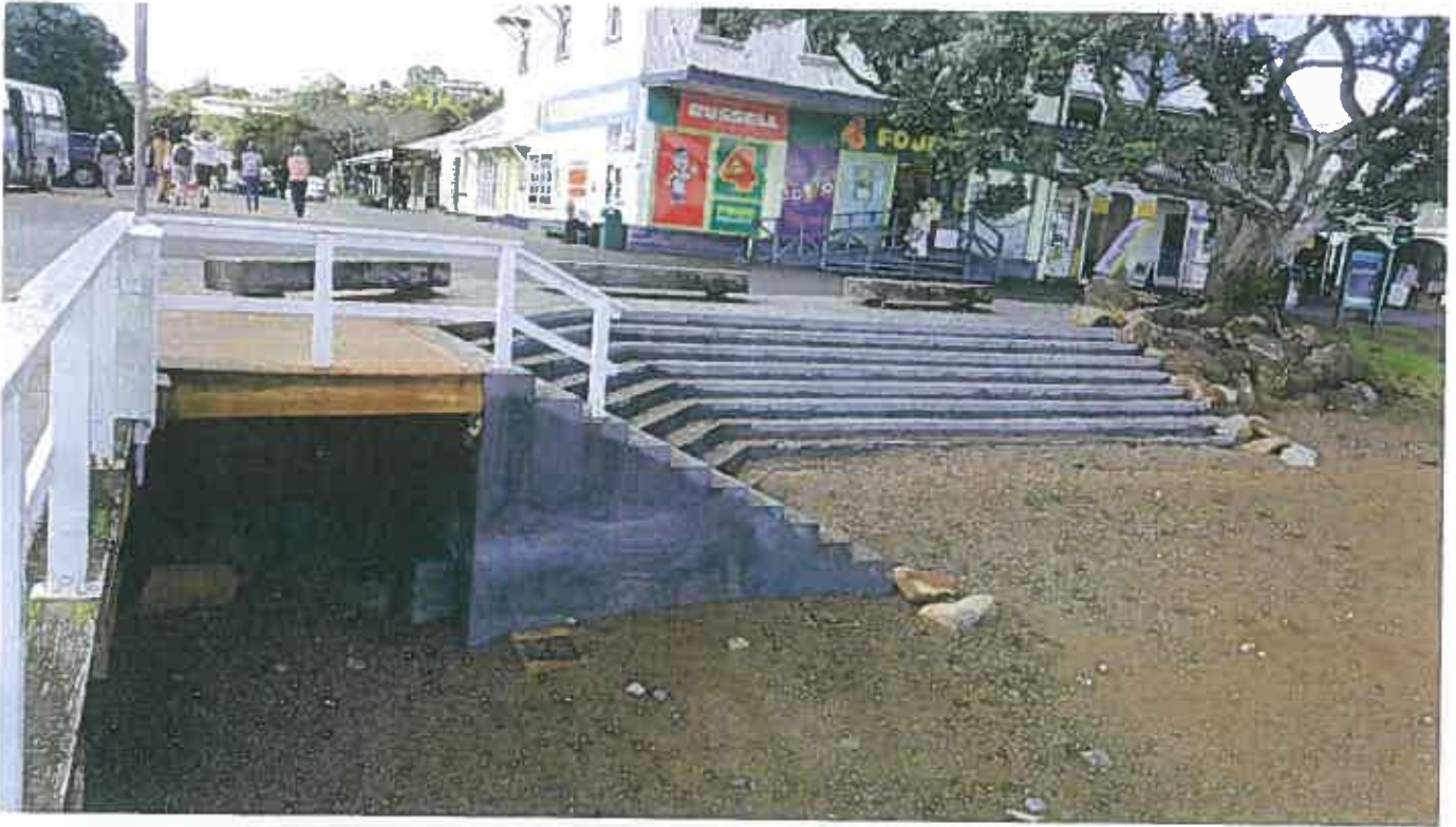
Recently constructed concrete steps towards beach in 2016