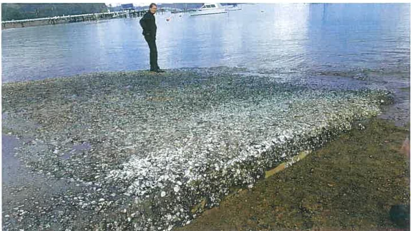
Very rough surface finish on toe of boat ramp (hard to clean problem)