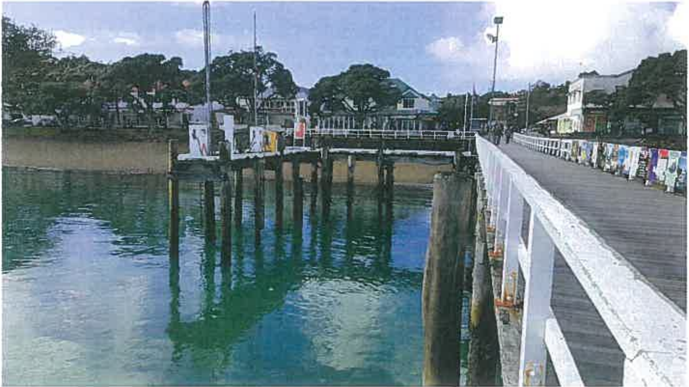
View of existing old fuel jetty (Requires renewal – due on 2015/16)