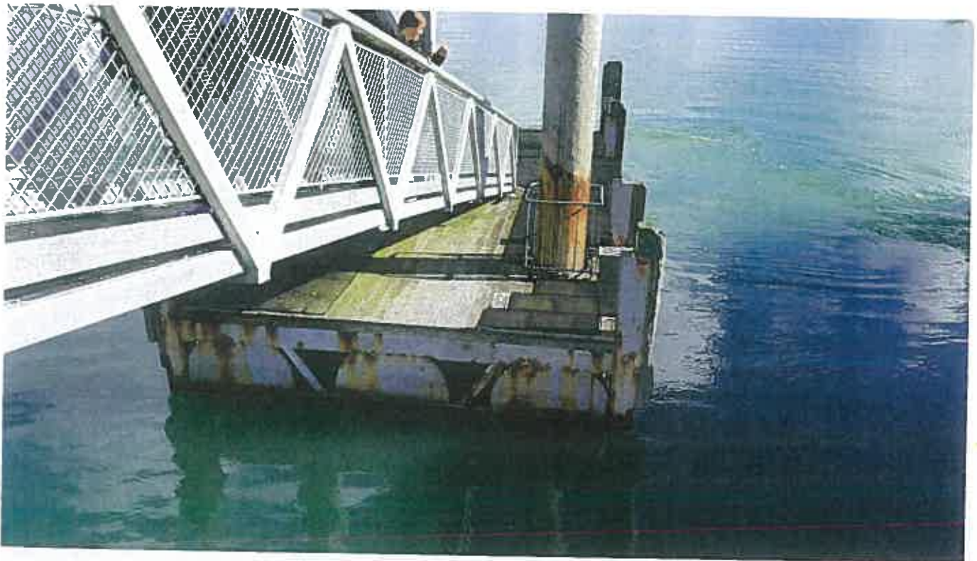
Deteriorating condition of rusted steel pile guide & piles & Steel pontoon (Repair work ongoing as required on steel pile guides until renewal)