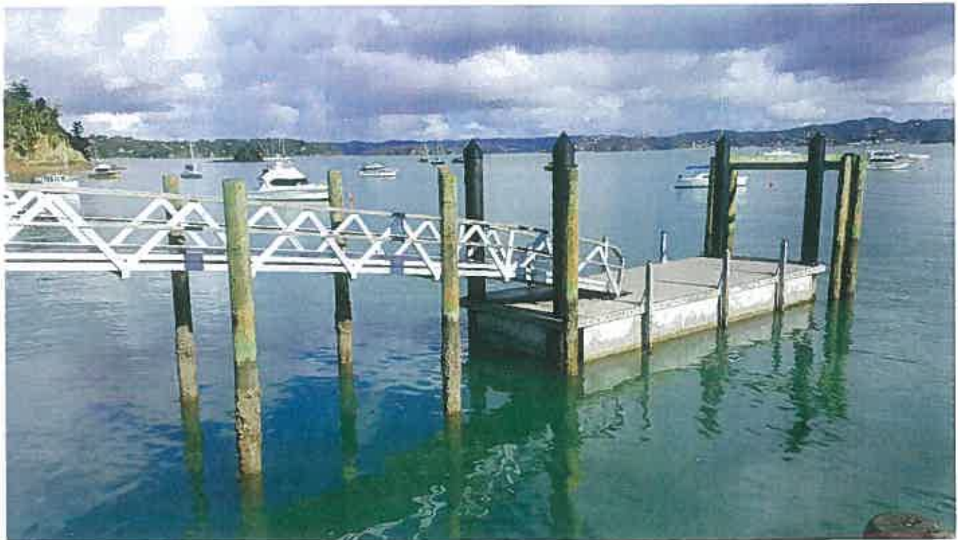
View of recently renewed cruiseship pontoon at end of Southern access way in 2012