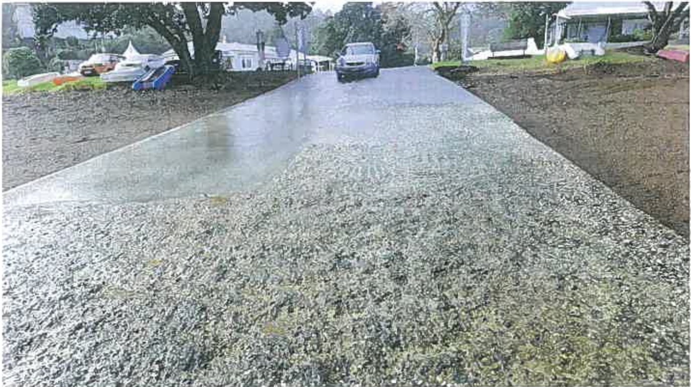
Very rough surface finish on mid and toe of boat ramp after renewal in 2012-13 (hard to clean problem)