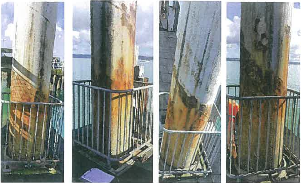
Deteriorating condition of rusted steel pile guide & piles at Steel pontoon (Repair work ongoing as required on steel pile guides until renewal)