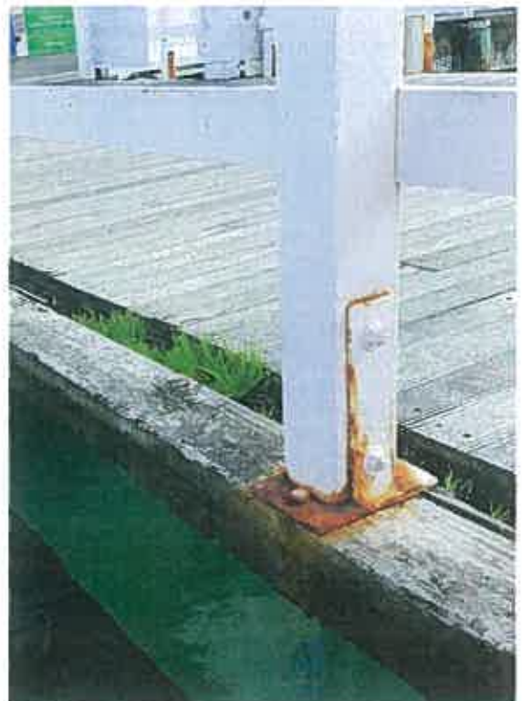
Outer boundary timber planks on approach bridge started rotting that requires cleaning and renewal and also requires renewal of handrail post footing plate