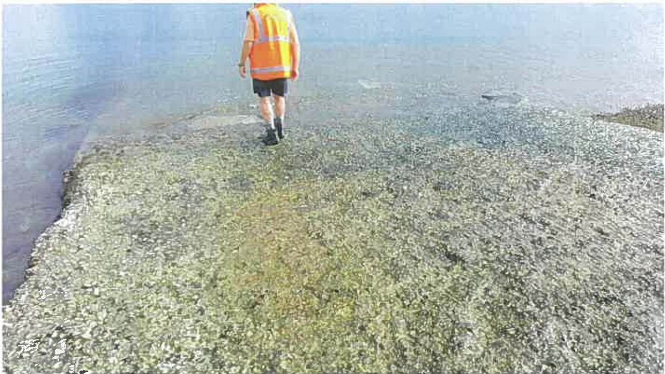
Very rough surface finish on toe of boat ramp (hard to clean problem)