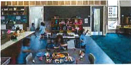
Queen Margaret College Preschool | Building on Tradition

McKenzie Higham Architects Level 1, 171 Vivian Street, Te Aro , PO Box 9792, Wellington, 6141, NZ