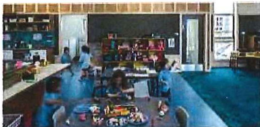
Queen Margaret College Preschool | Building on Tradition

McKenzie Higham Architects Level 1, 171 Vivian Street, Te Aro . PO Box 9792, Wellington, 6141. NZ.