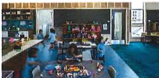
Queen Margaret College Preschool | Building on Tradition

McKenzie Higham Architects Level 1, 171 Vivian Street, Te Aro . PO Box 9792, Wellington, 6141. NZ.