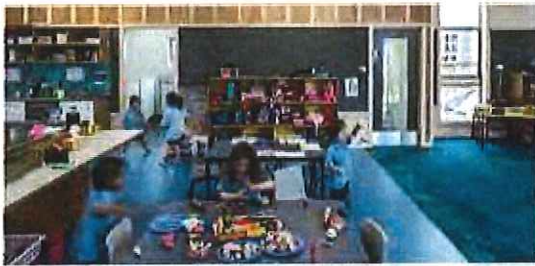
Queen Margaret College Preschool | Building on Tradition

McKenzie Higham Architects Level 1, 171 Vivian Street, Te Aro , PO Box 9792, Wellington, 6141, NZ